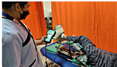
CONTINUOUS PASSIVE MACHINE STEPPER MACHINE