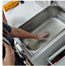
PARAFFIN WAX BATH