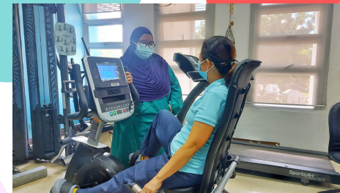
LOWER EXTREMITY ERGOMETER