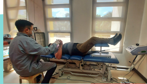
INTERMITTENT LUMBAR TRACTION